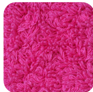
570 HAPPY PINK