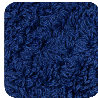
332 CADETTE BLUE