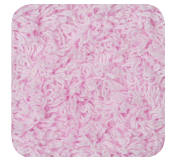
501 PINK LADY