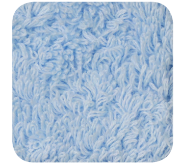
330 POWDER BLUE