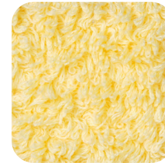
803 POP CORN