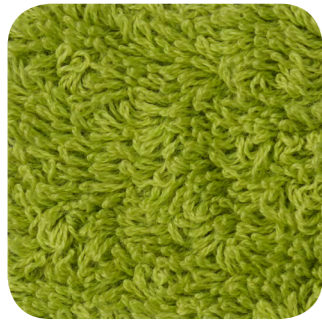
165 APPLE GREEN